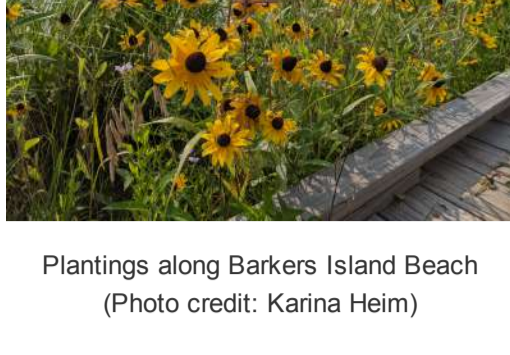
Plantings along Barkers Island Beach

A team led by Karina Heim, Coastal Training Program Coordinator with the Lake Superior Reserve, was recently awarded $73,666 for a project titled, Greener Shores: Bringing Plant-Scale Knowledge to Shoreline Habitat Practitioners in the Lake Superior Basin . The team will create a regional shoreline planting guidebook for coastal & estuarine Lake Superior environments. Contributing partners include the Great Lakes Indian Fish & Wildlife Commission & the Lake Superior Research Institute at UW-Superior. NERRS Science Collaborative press release